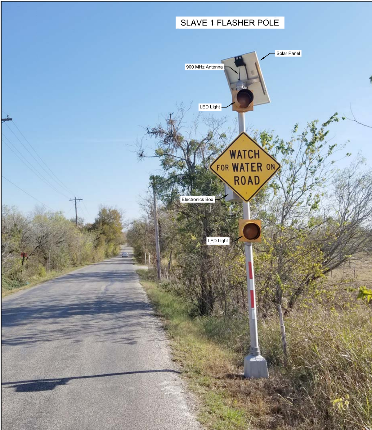
SLAVE 1 FLASHER POLE